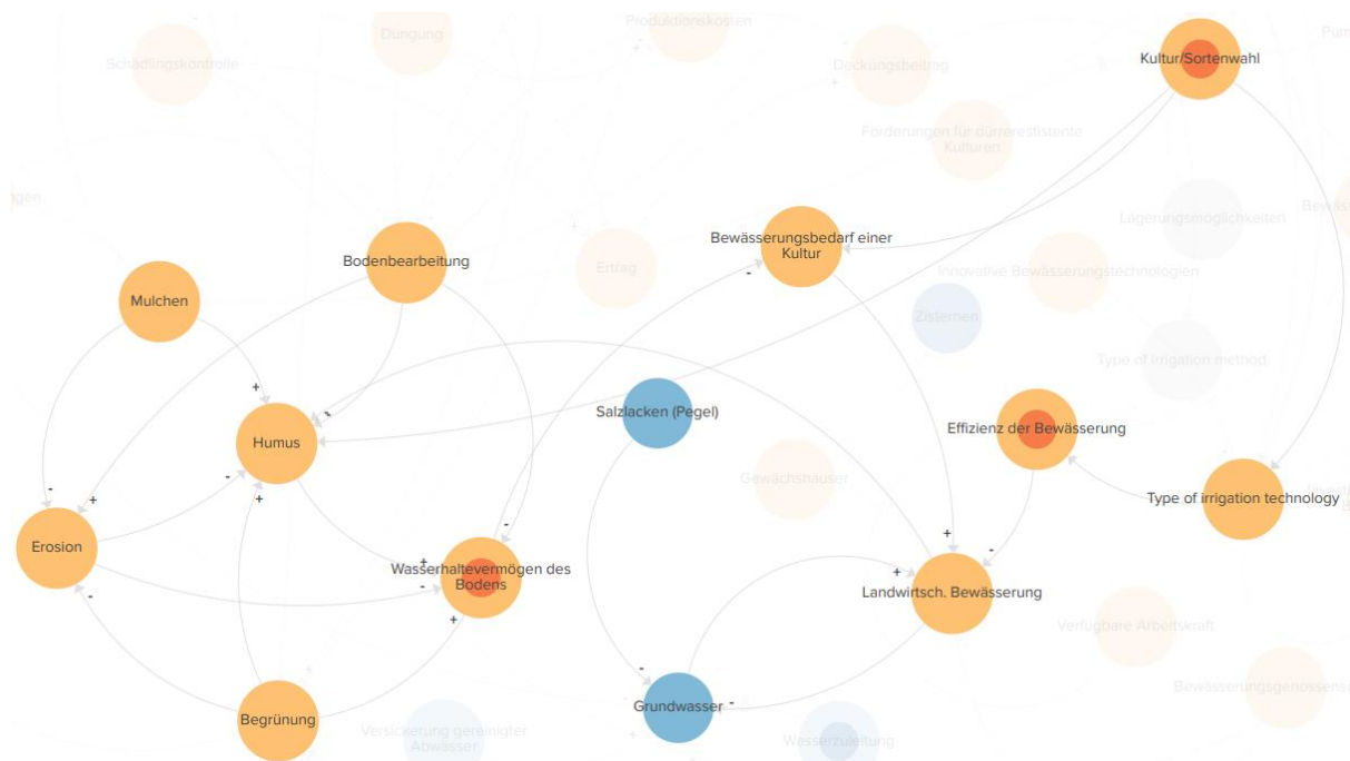
Figure 1: Screenshot of the Seewinkel system map on kumu.io, analyzing the impact chains between Seewinkel management options and agricultural irrigation.

By integrating CAP interventions in a systems map, we can visualize and analyze their potential to foster sustainable water management practices and a reduction in irrigation, as well as to which extent they contribute to an incremental or transformative change of water management strategies.